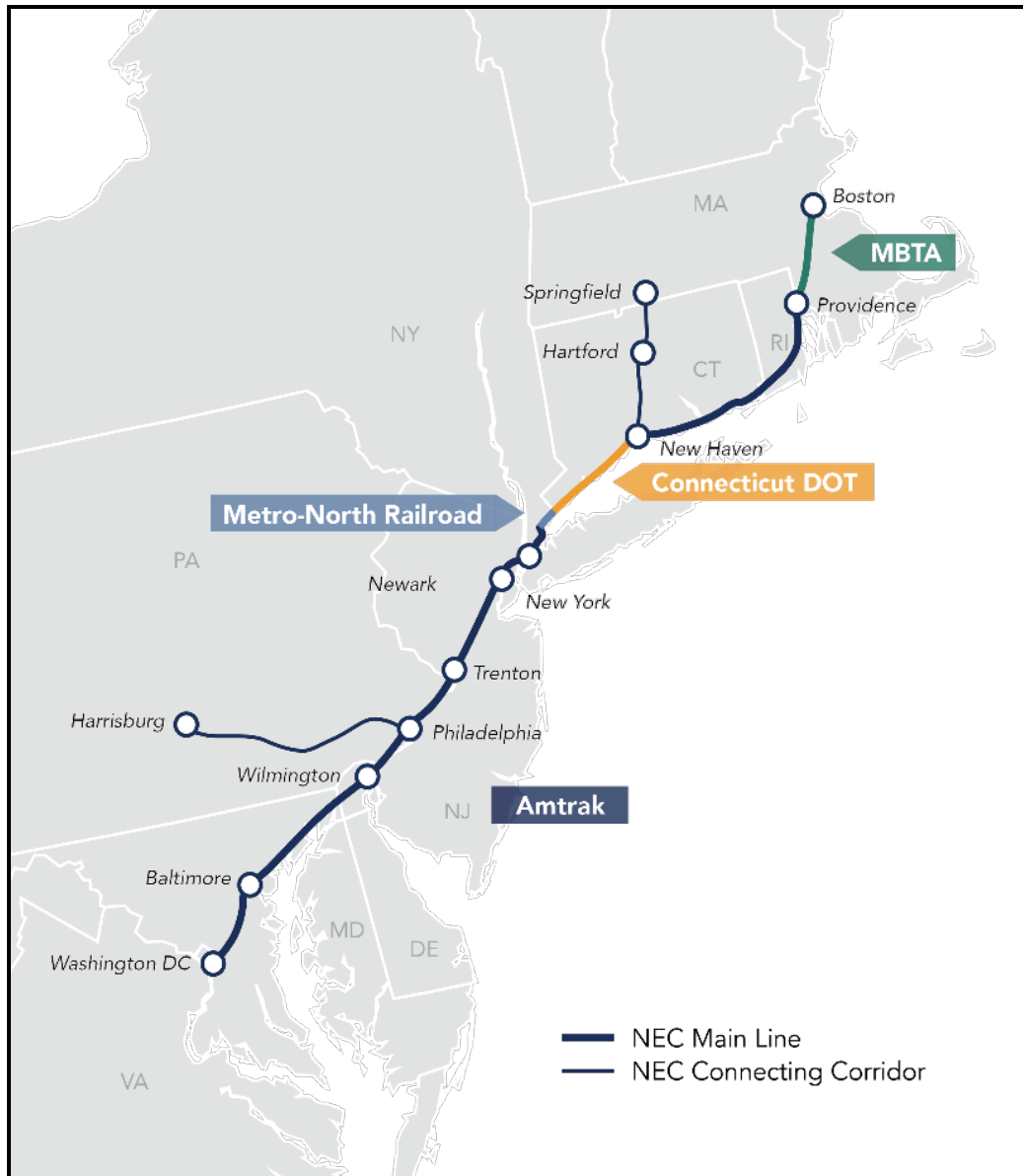
Figure 2: Ownership of the NEC Rail Network