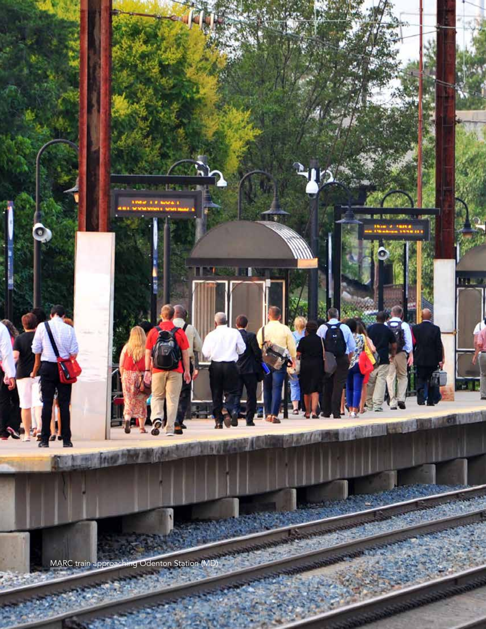
MARC train approaching Odenton Station (MD)