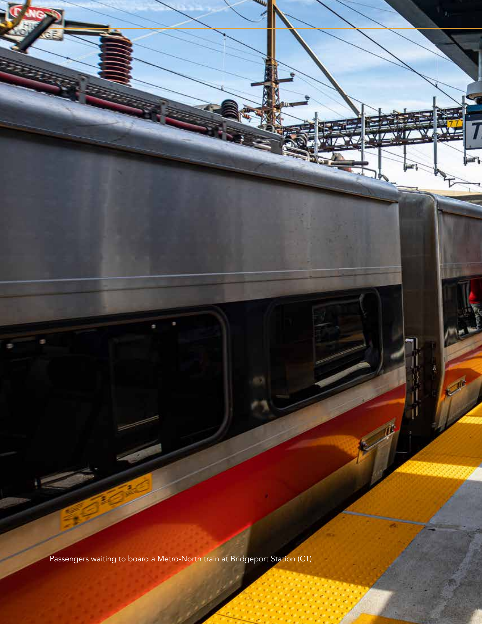
Passengers waiting to board a Metro-North train at Bridgeport Station (CT)