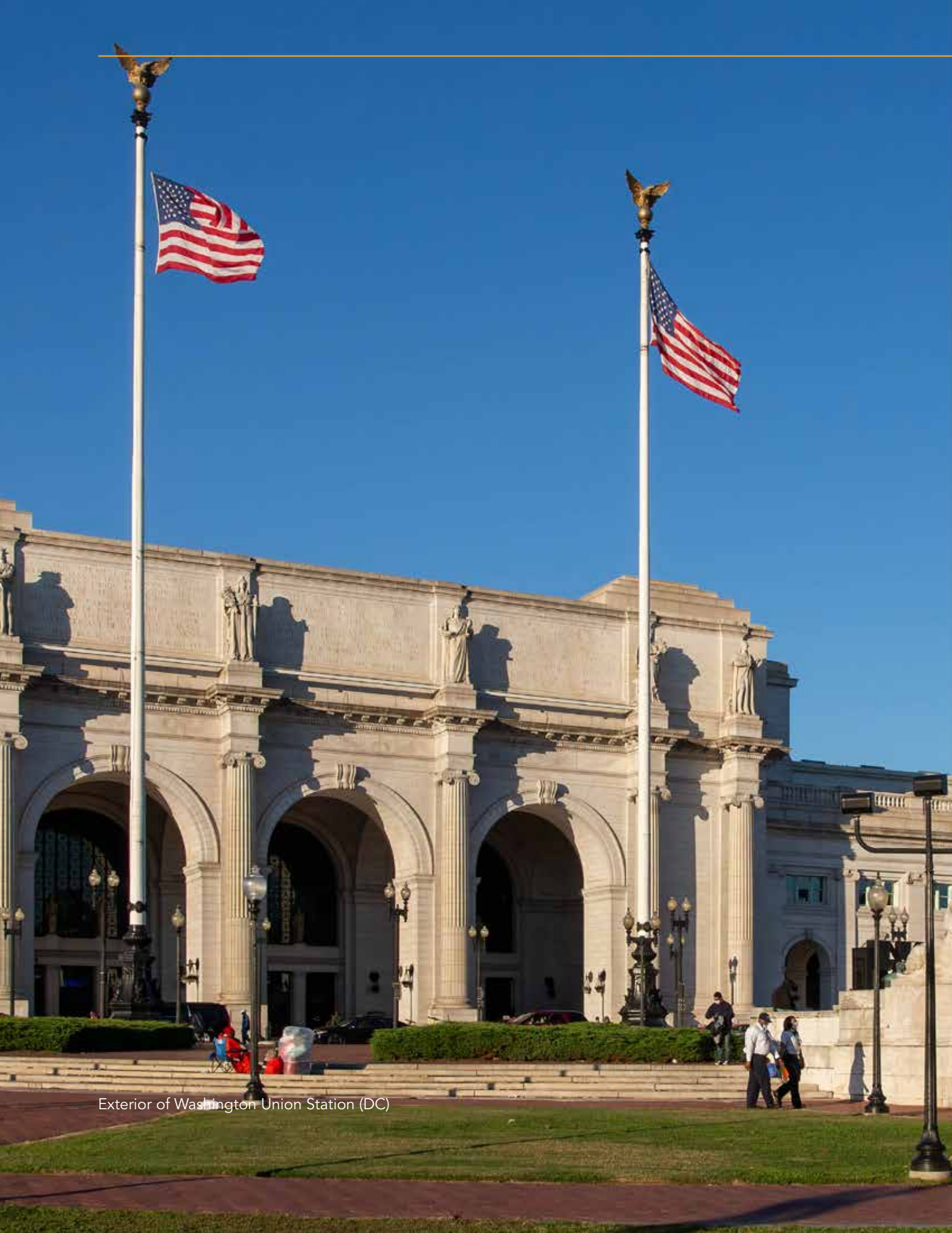
Exterior of Washington Union Station (DC)